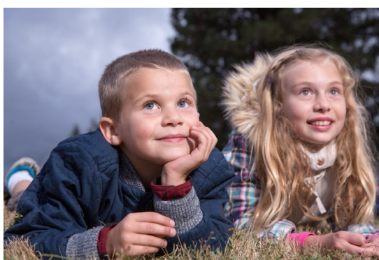
Youth ages 8 to 19 as of January 1 of the program year are eligible to be Michigan 4-H members.

The new 4-H programming year is finally here, and with it comes changes to the Michigan 4-H Age Policy. Beginning September 1, the Michigan 4-H Participant Age Policy reflects a younger beginning age for 4-H members. The new age for 4-H members is 8 to 19 years old, continuing to use January 1 of the program year as the date of calculation. The 4-H Cloverbud experience will remain available to youth ages 5-7.